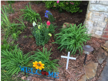
(Left) Fresh flower beds, Dianne and hubby.

COVID-19 Activity: Yard work, reading, working jigsaw puzzles, webinars and cleaning.